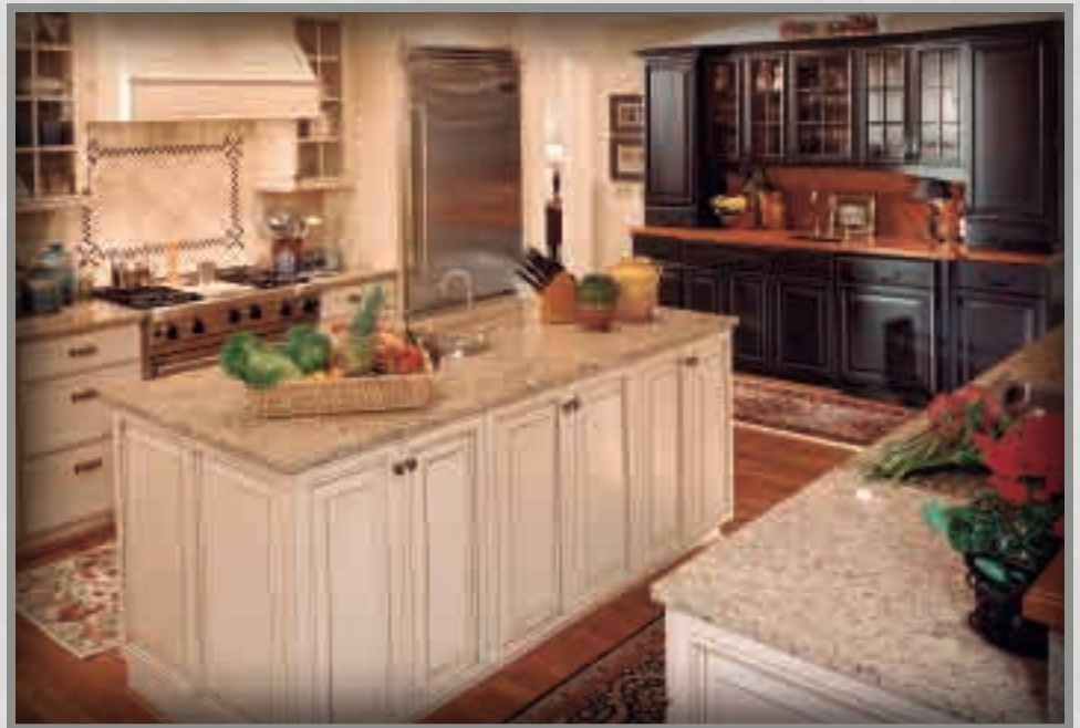
Kitchen Finish/Wood: Cameo w/Mocha Glaze Maple Door Style: Newcastle Island Finish/Wood: Ebony Maple w/ Vintage Artistry Door Style: Newcastle