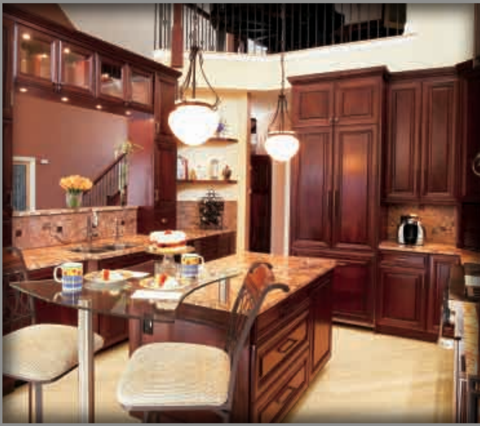
Engelbrook Concord, Cherry

Finish/Wood: Concord Cherry Door Style: Springdale