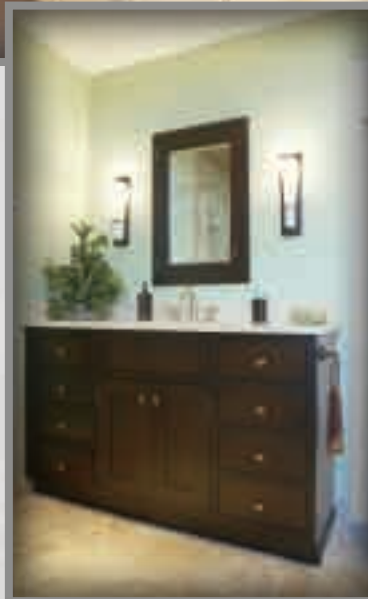
Finish/Wood: Coffee Bean Cherry Door Style: Seattle Inset w/3" Stiles & Rails

As with every Holiday Kitchens' product, the principle behind our specialty line is simple – if you can dream it, we can build it. Make a statement about your style with cabinetry that keeps its function and flair for years to come.