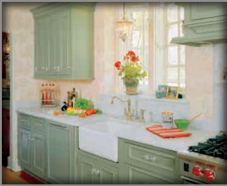
Finish/Wood: Custom Match w/Alpine Glaze Maple Door Style: Lincoln Inset w/3" Stiles & Rails