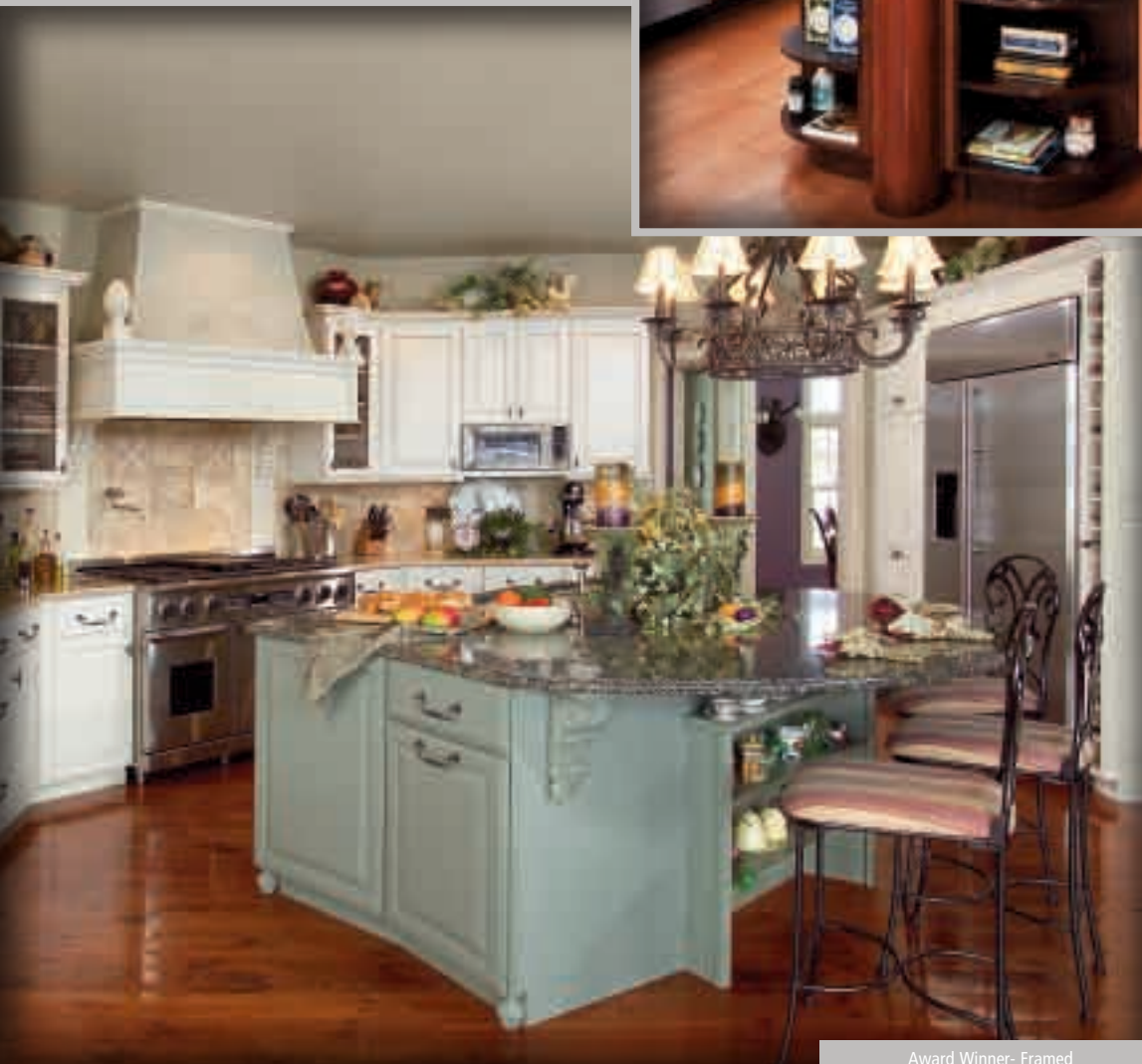
Award Winner- Framed

Kitchen Finish/Wood: Snowdrift w/ Mocha Glaze Maple Door Style: Summit Square Island Finish/Wood: Sage Maple Door Style: Summit Square Designed by: Wendy Tupper - Cabinet Country