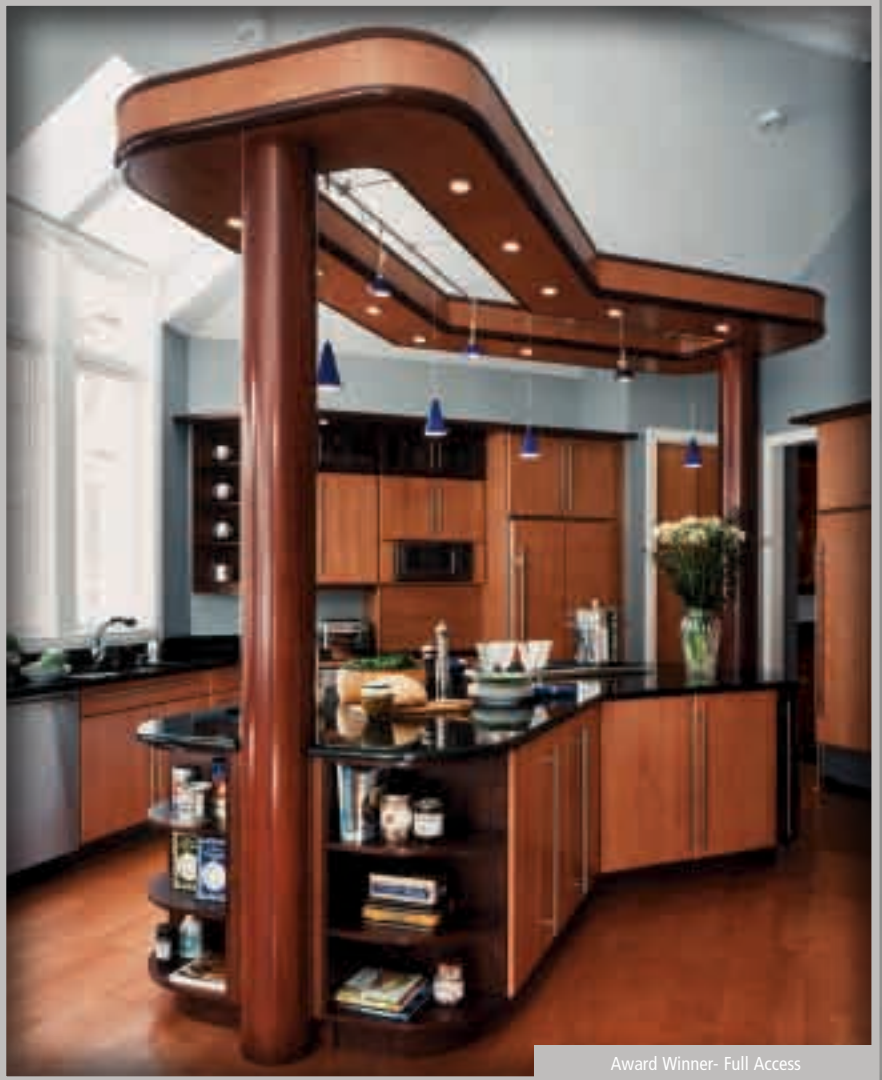
Award Winner- Full Access

Finish/Wood: Custom Match Maple & Concord Cherry Door Style: Contemporary