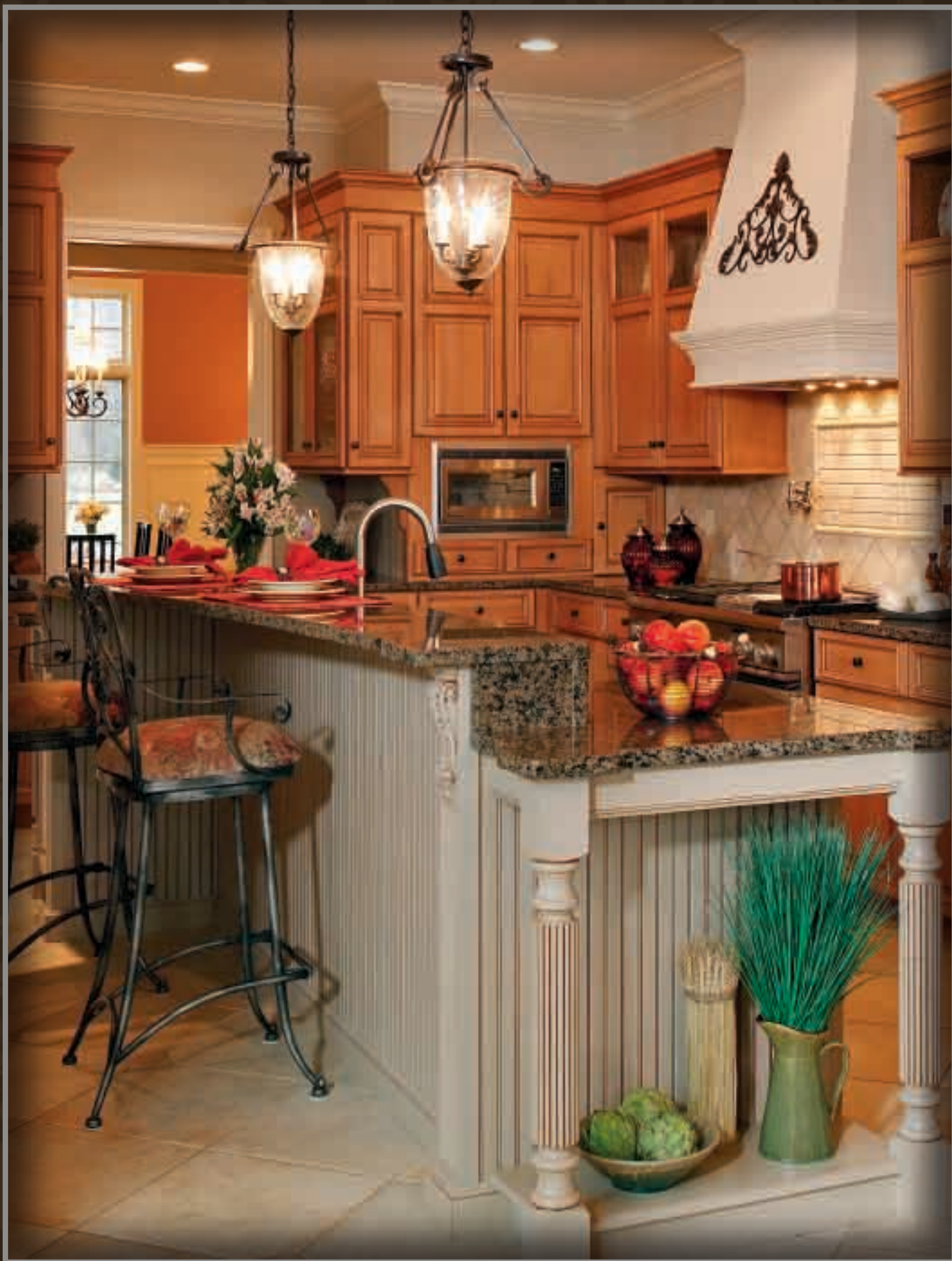
Finish/Wood: Kitchen: Fawn w/Mocha Glaze on Maple Island: Vineyard w/Toffee Glaze on Maple Door Style : Georgian