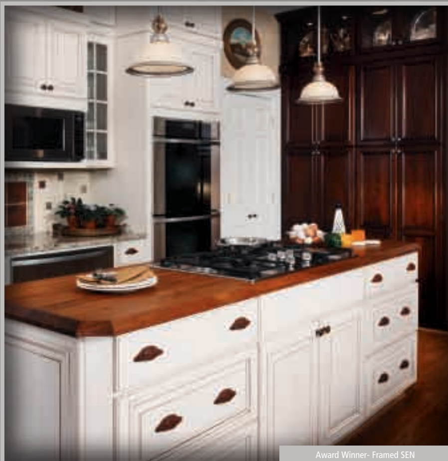
Award Winner- Framed SEN