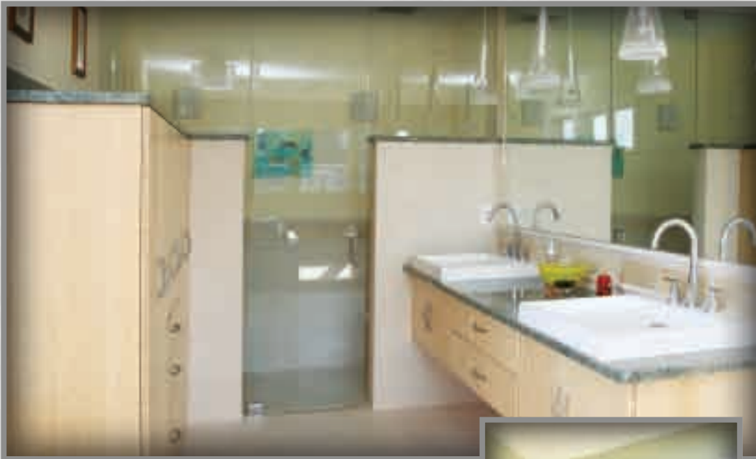
Finish/Wood: Natural Blonde Bamboo Door Style: Moso