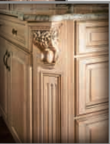
Winchester Square Bone (Paint), Maple