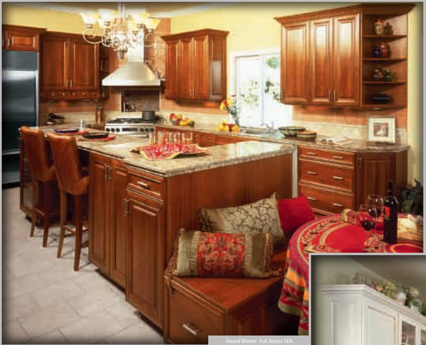
Award Winner- Full Access SEN