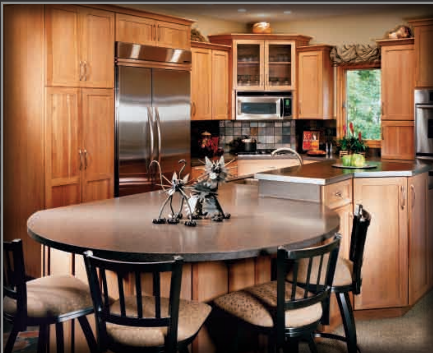
Finish/Wood: Custom Match Cherry Door Style: Seattle