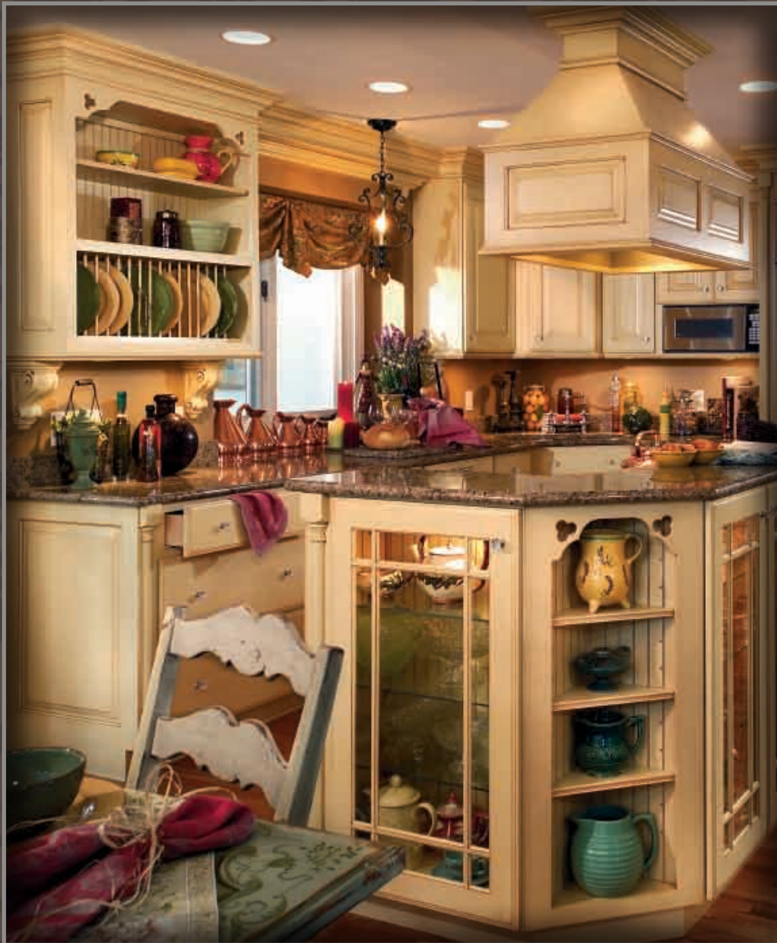
Finish/Wood: Parfait w/ Toffee Glaze Maple w/ Vintage Artistry Door Style: Summit Square w/ 3" Stiles & Rails