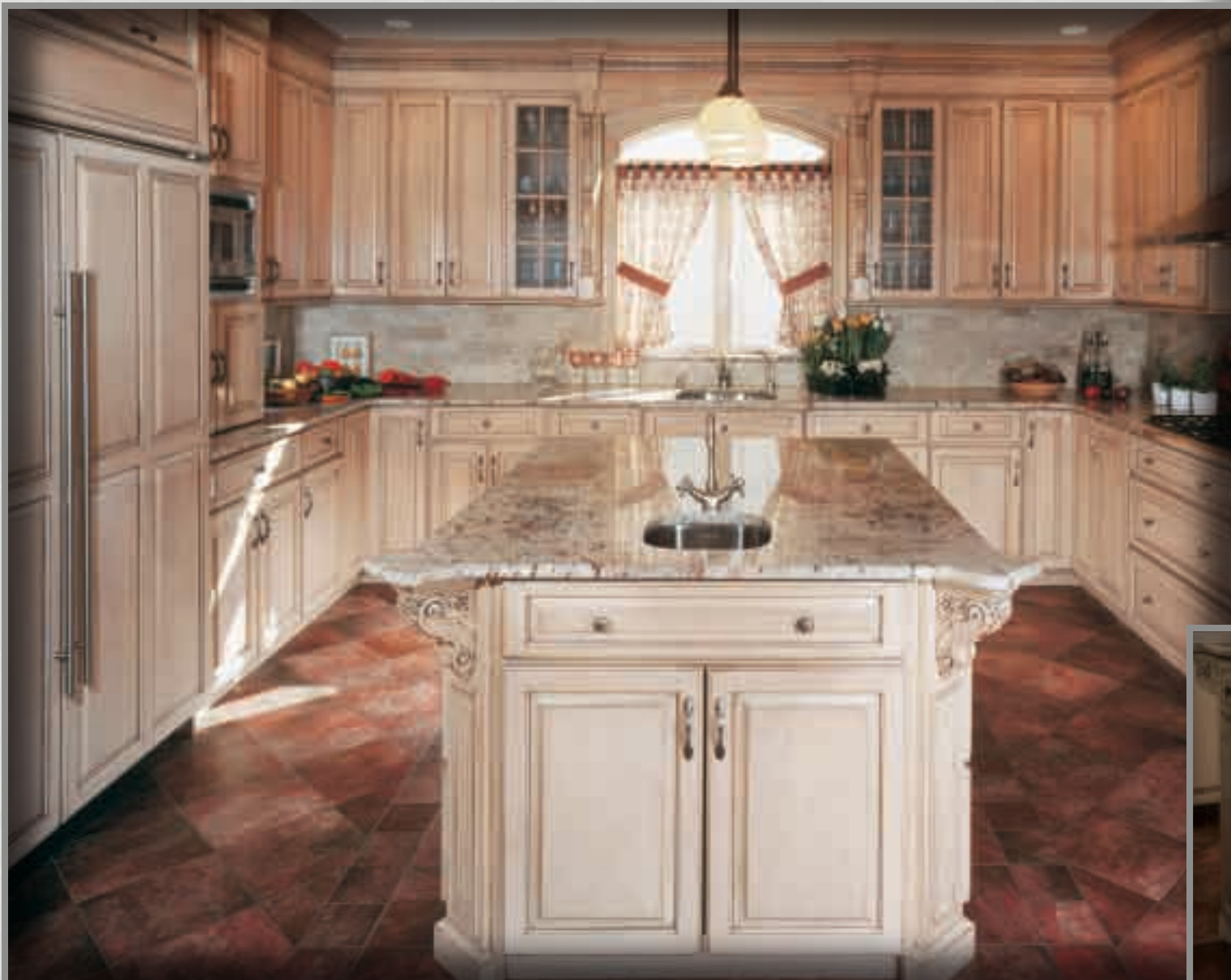
Finish/Wood: Custom Match w/ Mocha Glaze Maple Door Style: Harrisburg Square