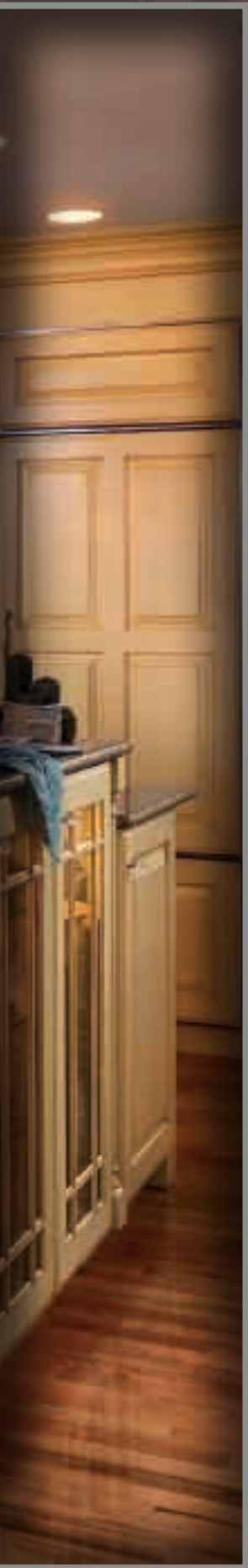
Lexington Double Arch Antique White (paint), Maple