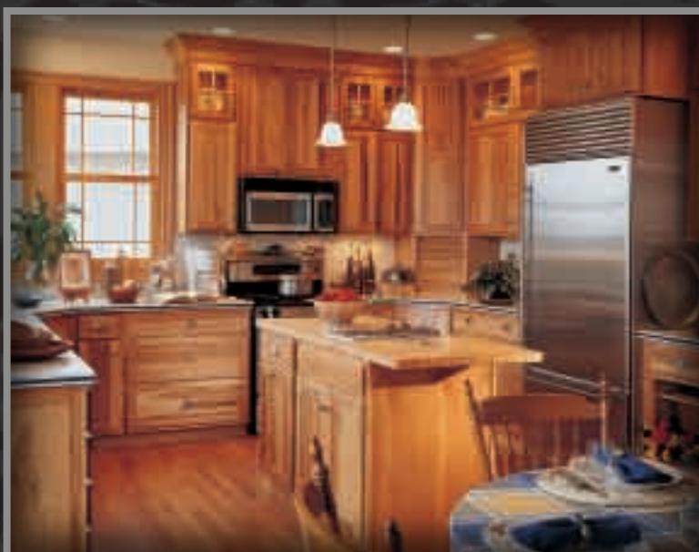
Finish/Wood: Natural Hickory Door Style: Seattle

Mix and match materials, finishes or hinges to create the look you've been dreaming about.