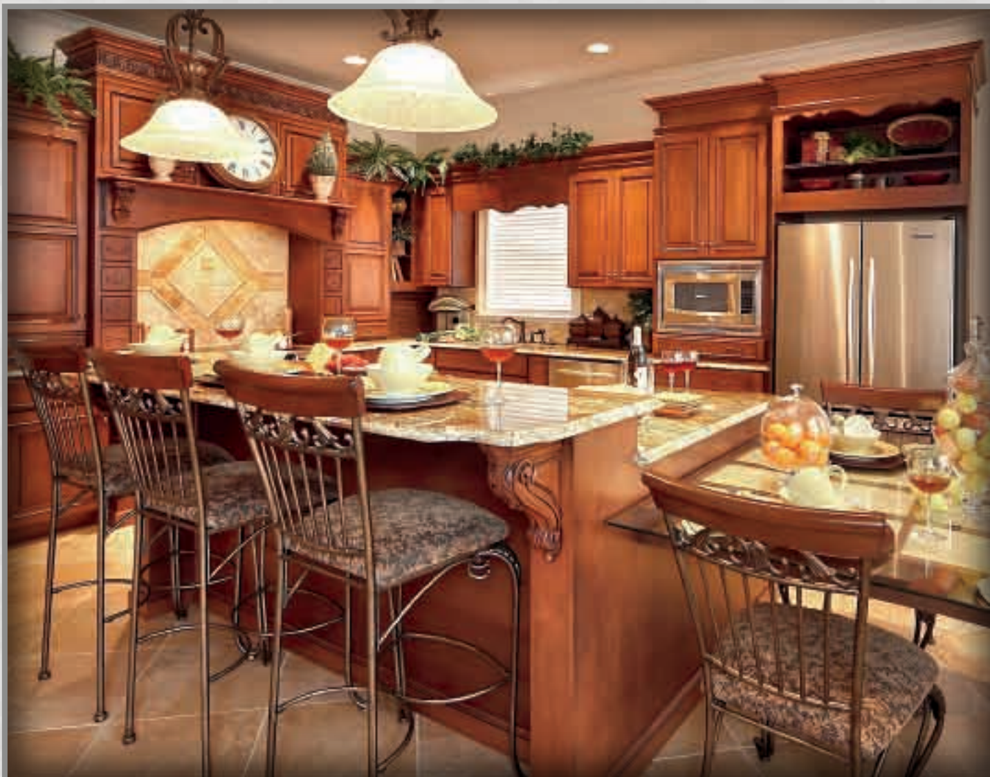
Finish/Wood: Russet w/Onyx Glaze Alder Door Style: Newcastle