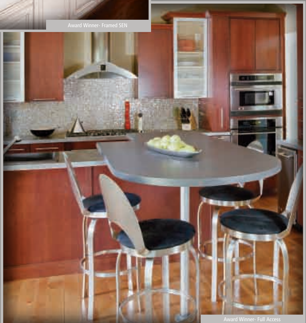
Award Winner- Full Access