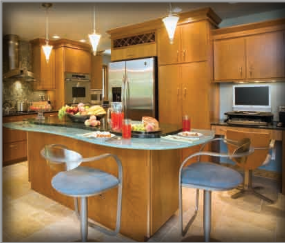
Jamestown Natural, Hickory

Finish/Wood: Natural Cherry Door Style: Munich