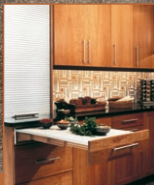
Stainless Rolling Shutter/ Rapid Pull Out Table