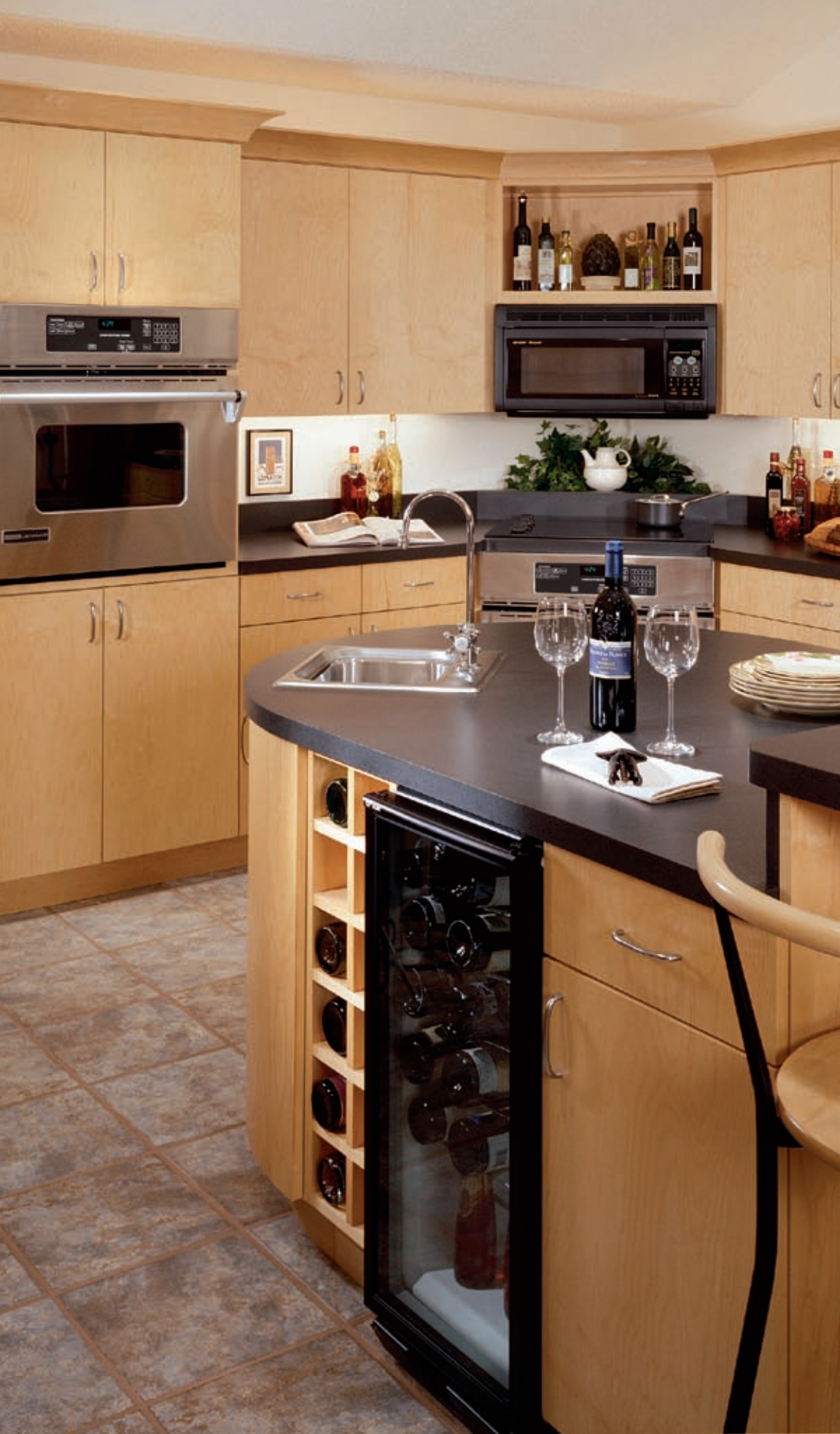
Finish/Wood: Praline Maple Door Style: Munich