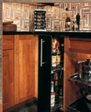
Base Full Height Pull Out