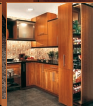
Tall Wire Pull Out Pantry

Finish/Wood: Butternut Cherry Door Style: Seattle #850 & Munich