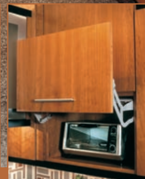
Wall Lift Up Door