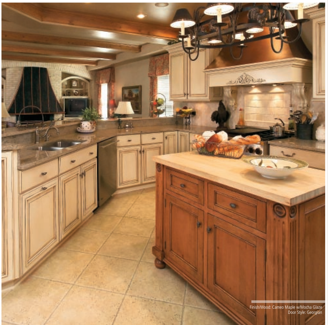
Finish/Wood: Cameo Maple w/Mocha Glaze Door Style: Georgian