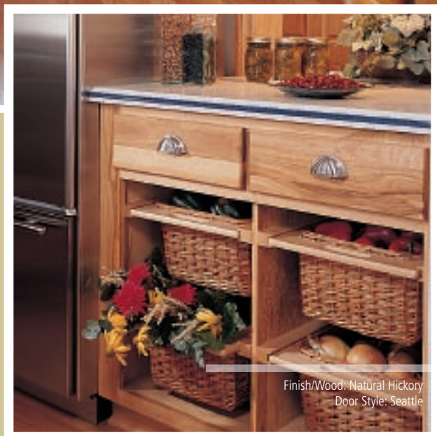
Finish/Wood: Natural Hickory Door Style: Seattle