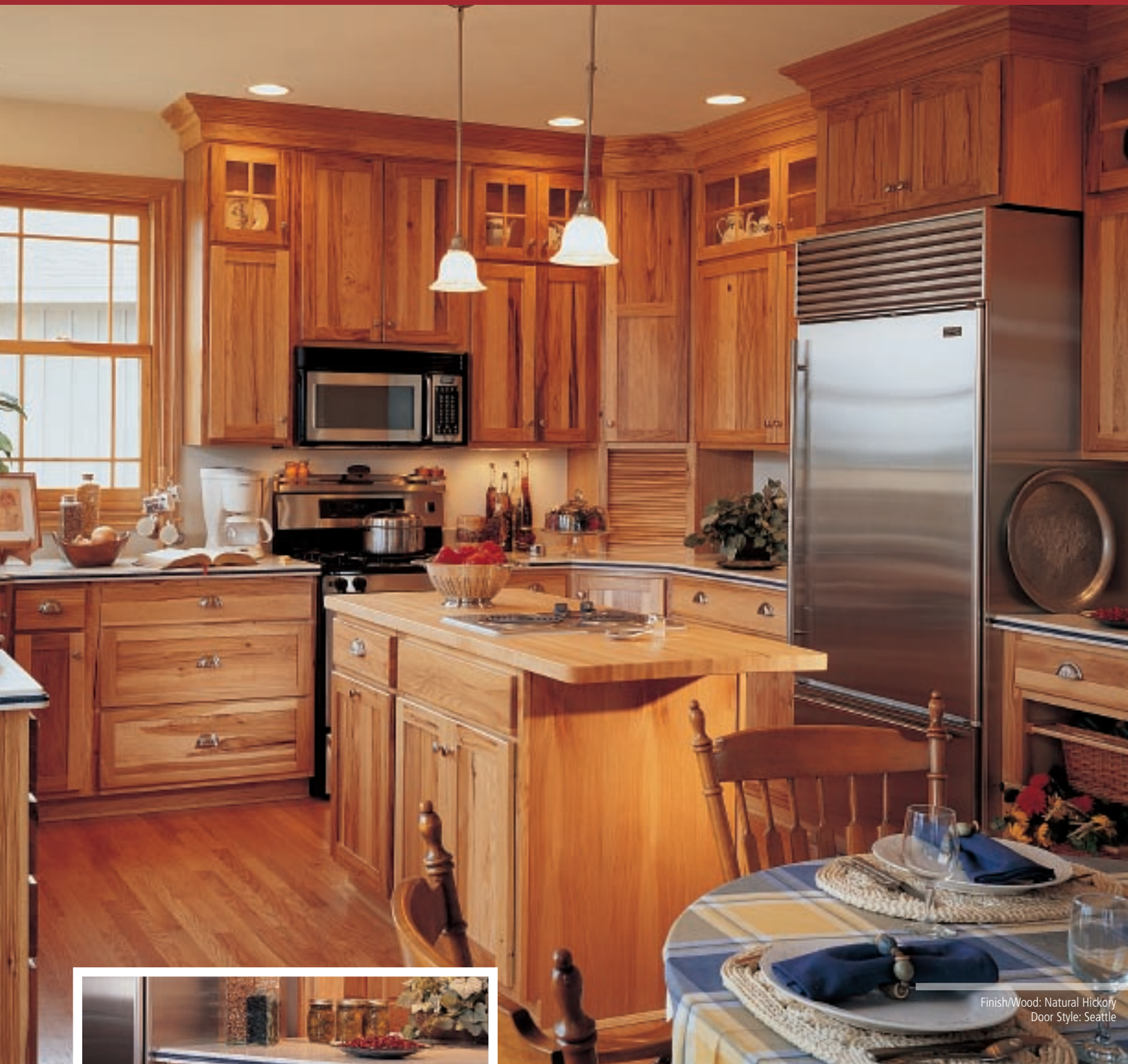
Finish/Wood: Natural Hickory Door Style: Seattle