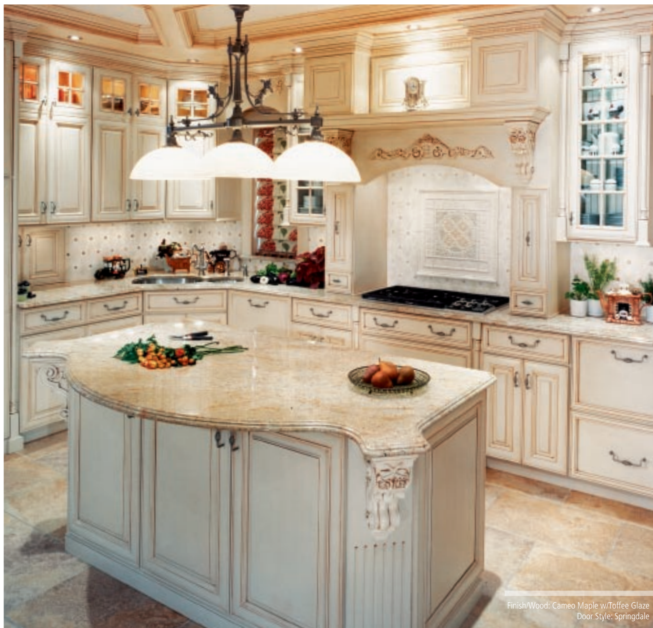
Finish/Wood: Cameo Maple w/Toffee Glaze Door Style: Springdale