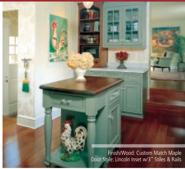
Finish/Wood: Custom Match Maple Door Style: Lincoln Inset w/3" Stiles & Rails