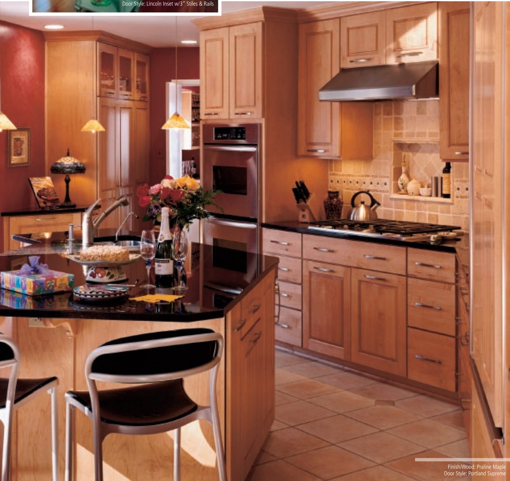
Finish/Wood: Praline Maple Door Style: Portland Supreme