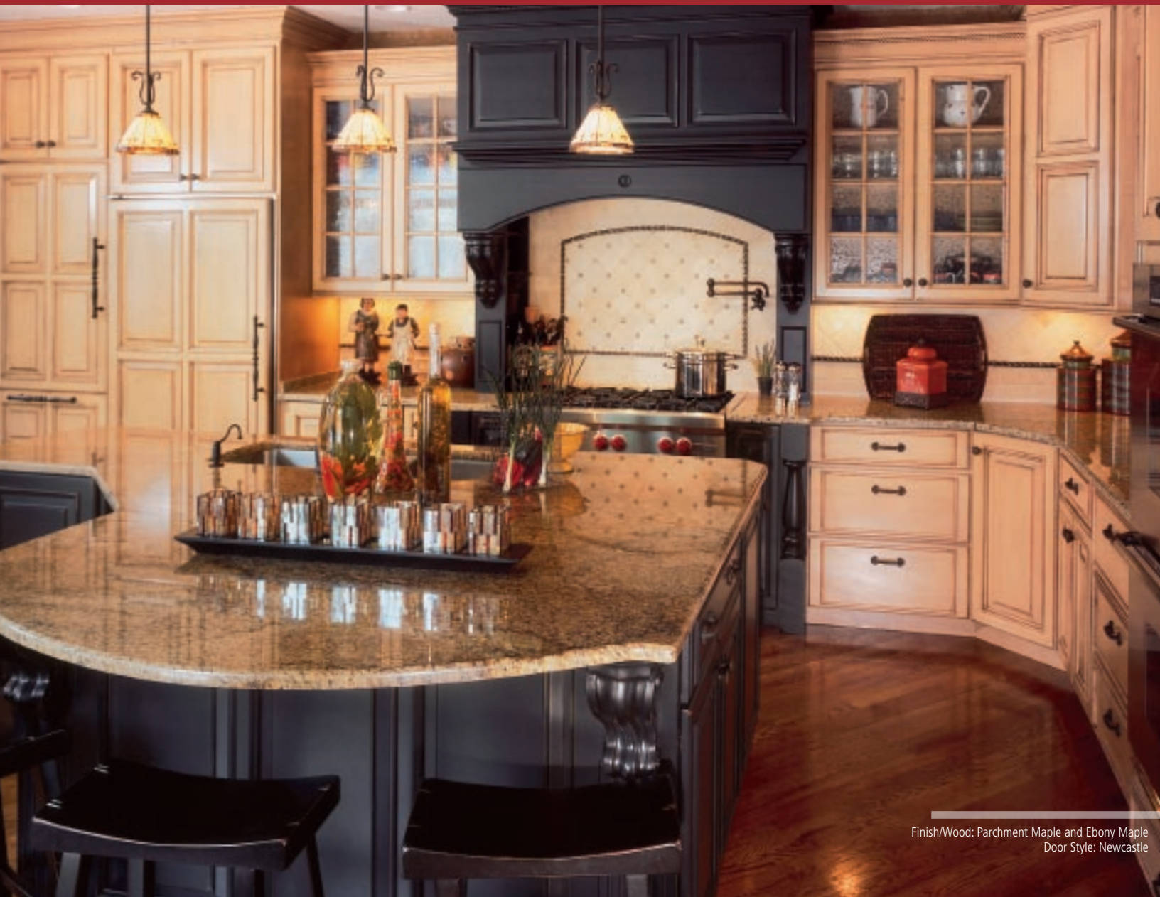
Finish/Wood: Parchment Maple and Ebony Maple Door Style: Newcastle