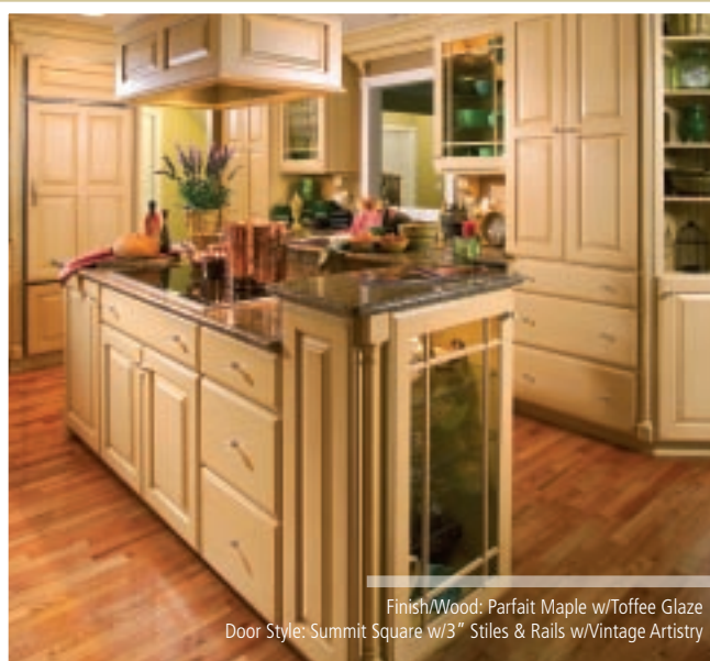
Finish/Wood: Parfait Maple w/Toffee Glaze Door Style: Summit Square w/3" Stiles & Rails w/Vintage Artistry

When design and functionality stand the test of time it's legendary. When joined with quality that lasts a lifetime it's called the