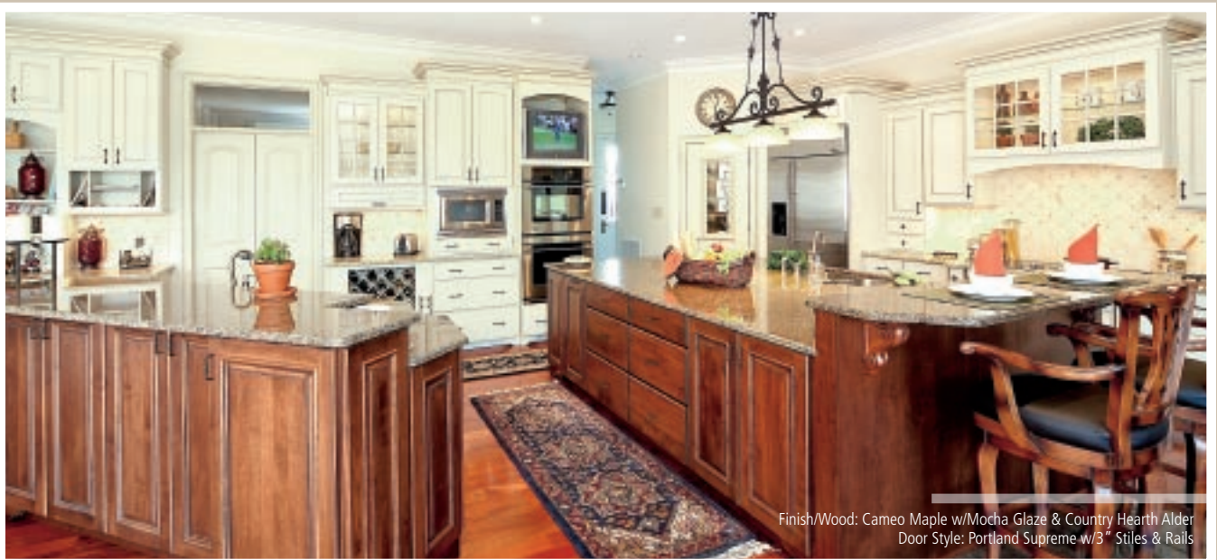
Finish/Wood: Cameo Maple w/Mocha Glaze & Country Hearth Alder Door Style: Portland Supreme w/3" Stiles & Rails